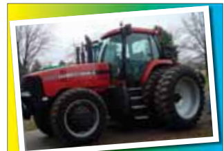
CASE IH - MX240, '00, 2300 hrs., rear duals, front wheel assist, front and rear weights, 3 valves, $77,500 Very good condition.

NEW & USED HYD. EJECT & DUMP TYPE SCRAPERS, TOREQ by Steiger Mfg., Prime Soilmoover, Leon, Misken, 3 to 18 yd. USED: 12 yd. Cable Converted Hyd. Eject., Several Shingle Axle and Tandem Daycabs. Grand River Sales 660-548-3804 www.grandriversales.com